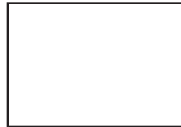
The Three Cs of Credit

In a figure like the one below, list and describe the three Cs of credit.