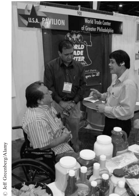
U.S. government-sponsored trade-show exhibits. The government is actively involved in export promotion.

As stated at the beginning of this chapter, export is an important source of economic growth and job creation. Furthermore, jobs that depend on trade pay between 13 to 18 percent more than the average wage. Therefore, government efforts to promote exports seem to make sense. Although exports may be considered a major engine of economic growth in the U.S. economy, many U.S. firms do not export. Many firms, particularly small- to medium-size ones, appear to have developed a fear of international market activities. Their management tends to see only the risks—informational gaps, unfamiliar conditions in markets, complicated domestic and foreign trade regulations, absence of trained middle managers for exporting, and lack of financial resources—rather than the opportunities that the international market can present. These very same firms, however, may well have unique competitive advantages to offer that may be highly useful in performing successfully in the international market.