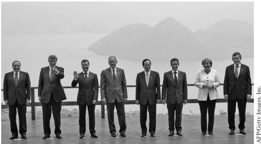
Group of Eight (G8) leaders met at the Toyako Summit in Japan in July 2008 to tackle a number of impending issues including climate change, the food crisis, and oil supply stability.

Russia joined the G7 in 1997, and the group consisting of the original G7 and Russia is known as the G8 . Heads of state, senior economic ministers, and heads of central banks typically meet once a year to further economic coordination. G7 meetings have primarily dealt with financial and macroeconomic issues (such as the Asian and Latin American financial crisis), but since Russia's participation, the G8 has included some politically sensitive issues such as an effort to make arrangements for the reconstruction of Kosovo—and indeed of the Balkan states as a whole—after the Kosovo conflict. Recently, as a result of a remarkable economic and democratic transformation, Russia has demonstrated its potential to play a full and meaningful role in addressing the global problems with the seven industrialized nations. The Group of Eight industrialized nations, in a G8 summit meeting in Calgary, Canada in June 2002, agreed to have Russia become the group's president and host the summit meeting in 2006. 75