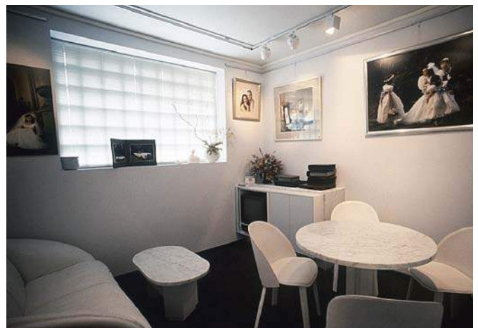
A well appointed studio sets the stage for building a good relationship with your client.